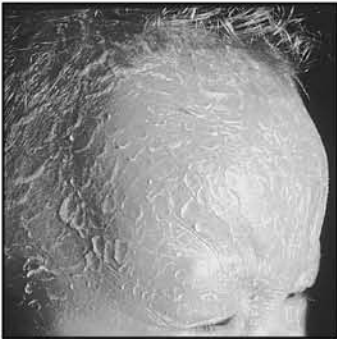
Problem Dry Skin (PDS) Symptoms of Lamellar Ichthyosis BEFORE