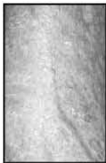
AFTER 4 WEEKS (outer, lower leg)